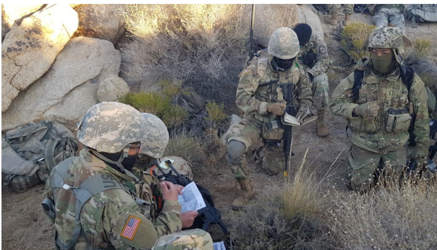
Cadet Platoon Leader and Platoon Sergeant create the plan after receiving the operation order to begin their tactical scenario

Why: To give back to the communities that have given us so much. Let's get out there and see what kind of difference we can make together!