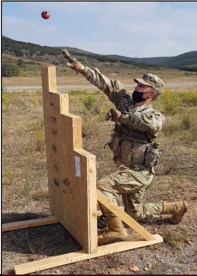
Aztecs have been gearing up all year to prepare for Advanced Camp at Ft. Knox this summer!